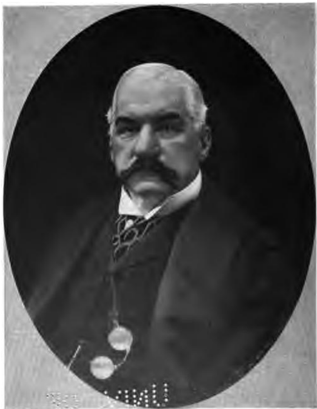
JOHN PIERPONT MORGAN